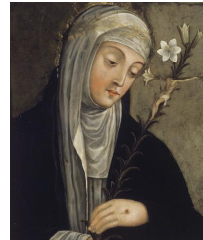
April 29 Patron of Nurses

St. Catherine of Siena Parish (est. 1892)